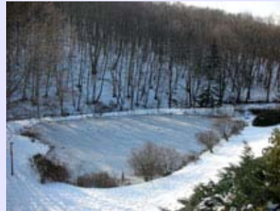
Our heart shaped pond our our back door.