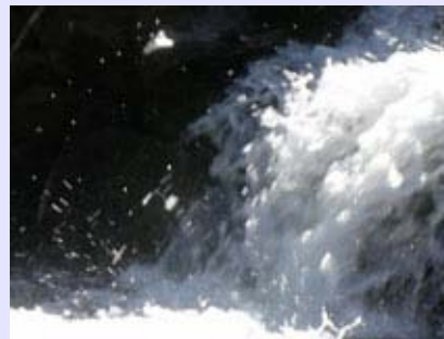
Winter storm gushes at my favorite watering hole - a healing rush of negative ions right at home. Too bad its sooooo cold.